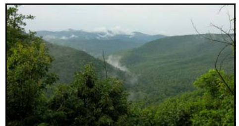
View of Shenandoah Mountain, GWNF.

There are dozens of other bills affecting your public lands. Please search http://thomas.loc.gov for more information.