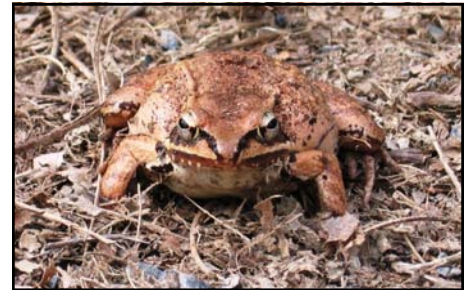
Wood frog, Rana sylvatica , in forests of Signal Corps Knob on GWNF.