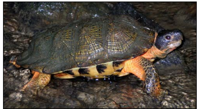
taken on the George Washington National Forest.

The Wood Turtle's natural habitat is clean-running streams and associated forest in the far northern portion of the state, an area subject to intense growth and development pressures. Protecting Wood Turtle populations and habitat on the GWNF appears essential to the long-term survival of the species in Virginia. Unfortunately, the security of Wood Turtles continues to be threatened by timber sales and other US Forest Service management activities.