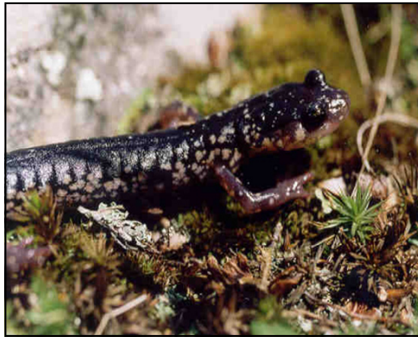
Cow Knob Salamander.

The Cow Knob salamander was not recognized as a distinct species until 1972 and it currently has no federal protection under the Endangered Species Act. It is listed as a species of special concern and is considered a sensitive species by the George Washington National Forest.